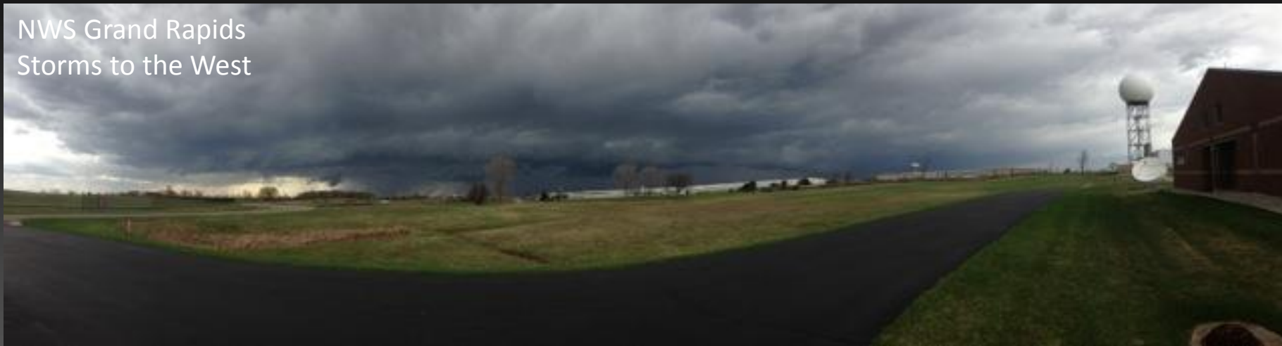
Traver McPherson Sparta, MI