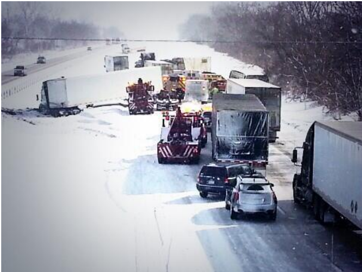
Accident on I-94.

OBSERVATIONS ARE COLLECTED FROM A VARIETY OF SOURCES WITH VARYING EQUIPMENT AND EXPOSURE. NOT ALL DATA LISTED ARE CONSIDERED OFFICIAL.